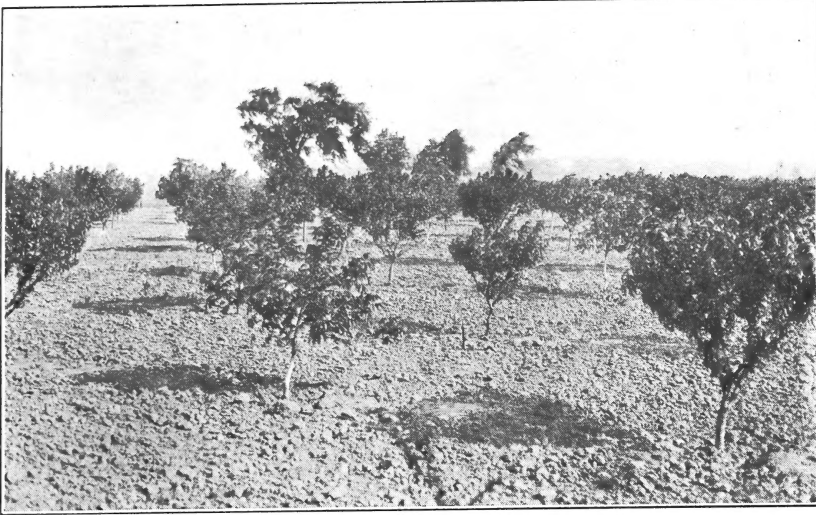
Photograph taken Spring 1911 of an orchard of Hardy Pomeroy English Walnut Trees

on the Pomeroy Farm, Lockport, N. Y., with peach trees used as fillers.